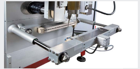
Sealing Jaw Area