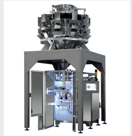
Custom solutions for integrated scales, augers and volumetrics

Hayssen Flexible Systems S.r.l Via Trieste, 53 | Mestrino (PD) | 35035 ITALY t. +39 049 9006511