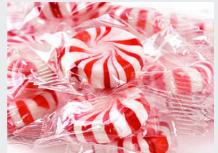
Ideal for Hard and Soft Candies