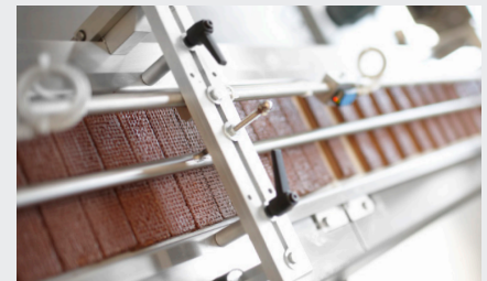
Automatic Feeder (option)