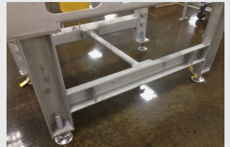
Open Channel Frame with no hollow tubing and no flat level surfaces