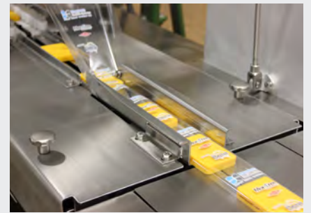
Suitable for wrapping a large variety of food and non-food products