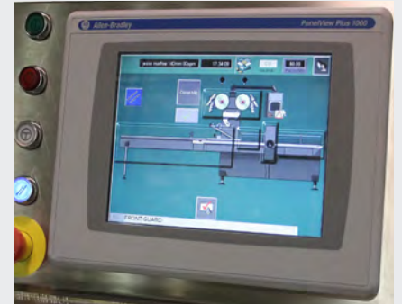
Icon-based operator interface with intuitive set-up features