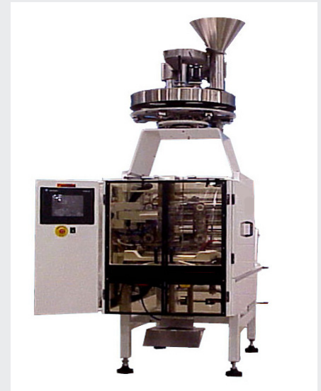
Ultima with Volumetric Filling System